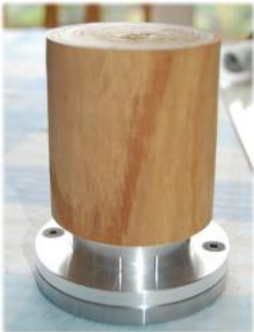
Workpiece mounted on chuck – but there's a snag...

I have a medium-sized lathe (an Axminster M900 – it's basically a copy of a Jet 1236). My main concern was whether the out-of-balance forces would introduce too much vibration and strain the headstock bearings. First of all I tried the chuck set in eccentric mode – I really needn't have worried. The aluminium eccentric plate and faceplate hardly produced any vibration at all. After mounting a lump of wood onto the faceplate there was still no cause for concern on that score.