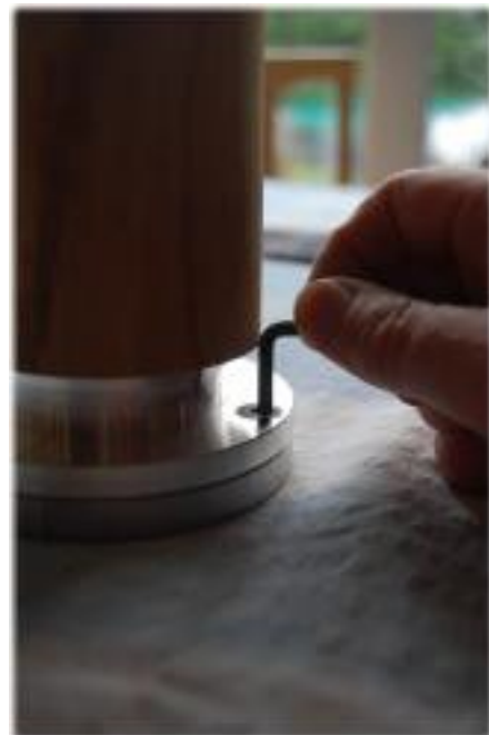
Now I can't get the Allen Key in the screw to offset the eccentric plate! (Photo deliberately darkened for clarity!)